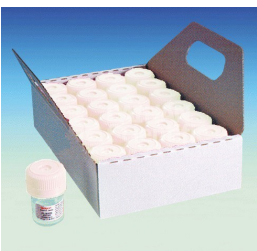
M961 Series packaged in sturdy cardboard boxes with handles for easy carrying.

Especially designed for collection, transport and storage of histology specimens, Simport offers shatter resistant polypropylene containers, eliminating most problems of leakage and evaporation. Containers are uniquely stackable, shatter resistant and are manufactured from virgin, translucent polypropylene. The magenta lids are ribbed for easy opening when hands are wet or gloved while the jars are stackable for easy, safe storage. Jars are translucent and specimens can be viewed without having to open the lid. Closures are manufactured from virgin polyethylene with a unique integrated leak-resistant seal. Containers vertical walls offer excellent rigidity. For color coding purposes, use a Capinsert™ (see T345 Series) on top of closure. Ten different colors are available.